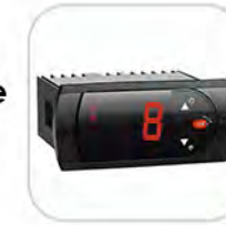
Digital temperature control