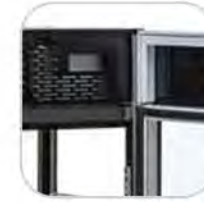
Inner light box