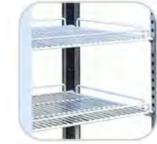
Adjustable height shelves