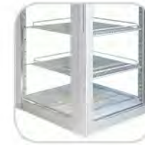
Four-sided visible glass design

We supply new design which is 4-sides glass display mini cooler with lightbox, can fully displayed from different perspectives. It's a special design with top advertising and 4-sides glass for business evening, product lanuch, shops and bars.